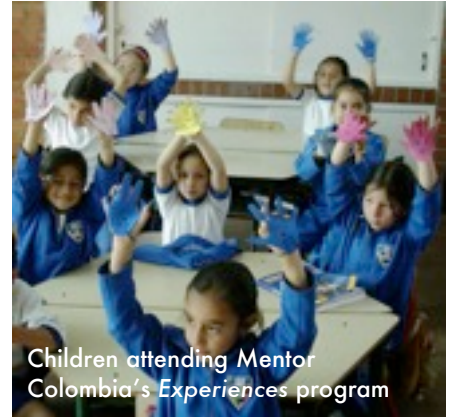
Children attending Mentor Colombia's Experiences program