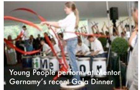
Young People perform at Mentor Germany's recent Gala Dinner