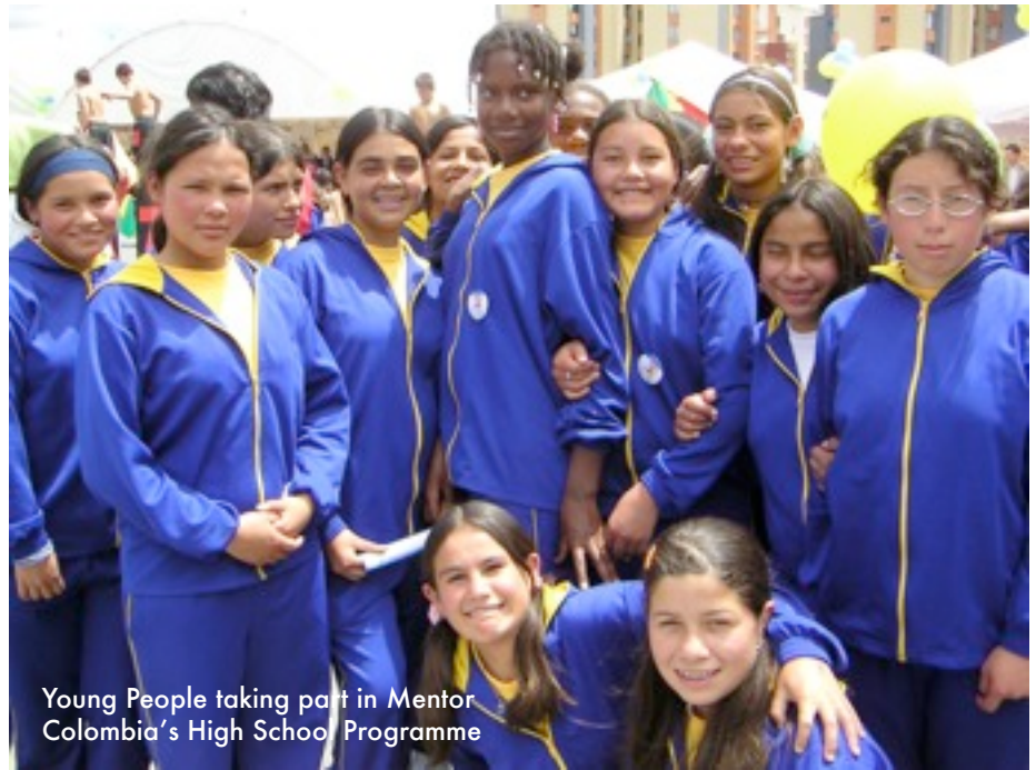
Young People taking part in Mentor Colombia's High School Programme

On the 8th and 9th of March of 2007 Mentor Colombia held its 3rd International Seminar, featuring 20 speakers and attended by more than 450 teachers, psychologists, doctors, police officers and researchers. The event focused on promoting and disseminating successful experiences in drug misuse prevention, that have been