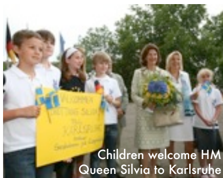
Children welcome HM Queen Silvia to Karlsruhe

The packs are available to order at www.mentorfoundation.org/uk/mindthegap