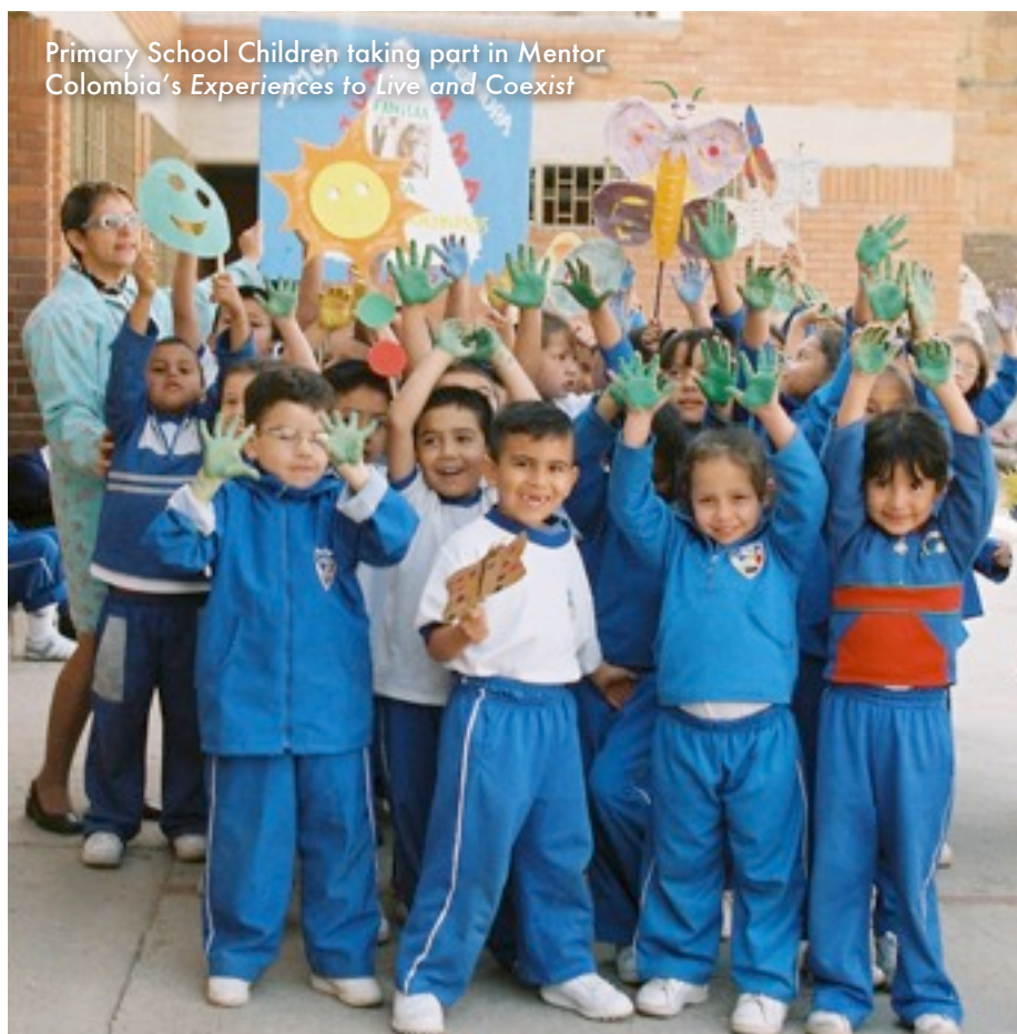
Primary School Children taking part in Mentor Colombia's Experiences to Live and Coexist