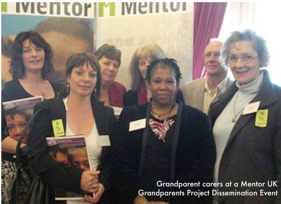
Grandparent carers at a Mentor UK Grandparents Project Dissemination Event