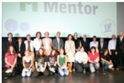
Mentor Germany's Prevention Congress

Running alongside the gala, the International Congress "Intoxication as risk and challenge – new ways of addiction prevention" caused brisk interest in the national media. Held on 15th and 16th June in Karlsruhe, the congress featured the Federal Drug Commissioner as well as experts from Germany, Austria, Switzerland and the USA discussing new ideas in addiction prevention. This congress was a great start for the Mentor Foundation Germany to gain a national profile in drug and addiction prevention and to establish itself as one of the leading organisations in the field.