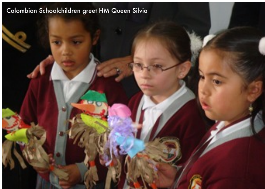
Colombian Schoolchildren greet HM Queen Silvia

Running alongside the gala, the International Congress "Intoxication as risk and challenge – new ways of addiction prevention" caused brisk interest in the national media. Held on 15th and 16th June in Karlsruhe, the congress featured the Federal Drug Commissioner as well as experts from Germany, Austria, Switzerland and the USA discussing new ideas in addiction prevention. This congress was a great start for the Mentor Foundation Germany to gain a national profile in drug and addiction prevention and to establish itself as one of the leading organisations in the field.