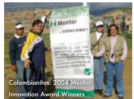
Colombianitos: 2004 Mentor Innovation Award Winners

The Mentor International Prevention Awards event will take place in France in June next year. Applications for projects that have "achieved" and those that "show promise" are required from any organisation from around the world undertaking practical prevention work. Details and application forms will be sent out and obtainable on the Mentor website ( www.mentorfoundation.org ) from 11 January (closing date for applications 31, March 2008).